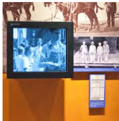
LARGER THAN LIFE: COMMISSIONED PORTRAITS OF LOCAL PEOPLE, A SECTION OF THE ORIGINAL WOOLWORTH COUNTER AND VINTAGE FILM CLIPS TELL OUR STORIES THROUGH ART, ARTIFACT AND TECHNOLOGY.