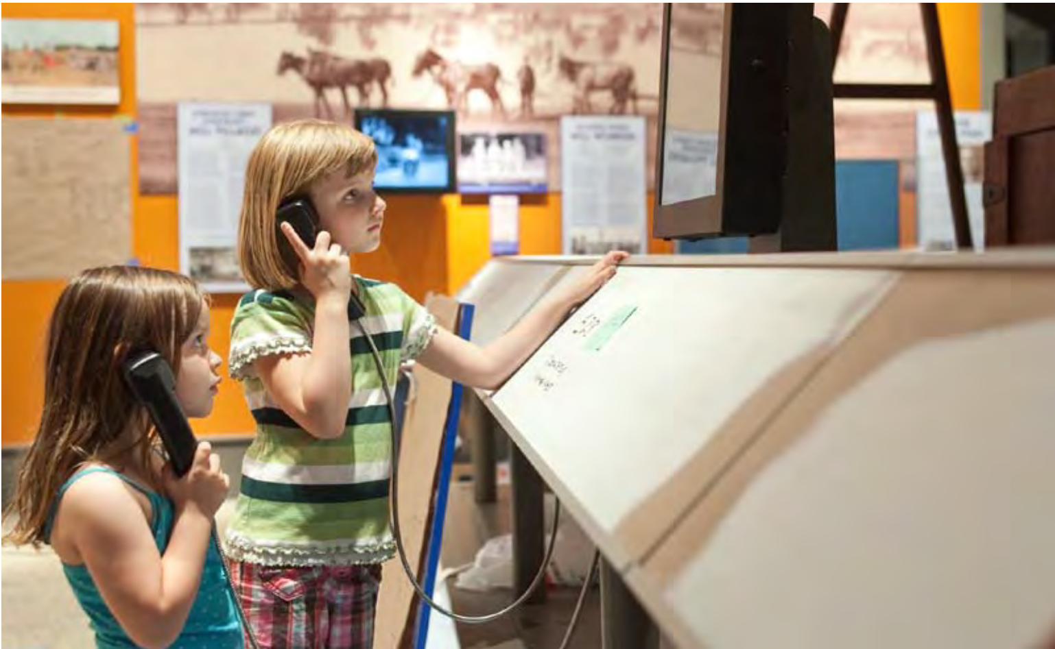
LISTENING IN: YOUNG VISITORS GET A SNEAK PREVIEW AND HELP US TEST AUDIO WANDS IN THE NEW DENIM CAPITAL GALLERY.