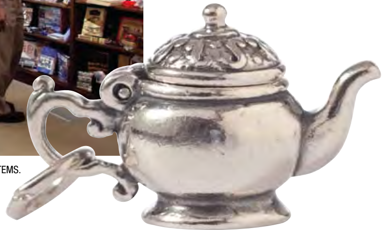
VISIT THE RENOVATED MUSEUM SHOP, WHICH FEATURES MORE THAN 1000 NEW ITEMS.