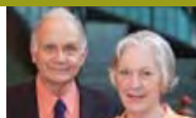
Announcing a new way to recognize dear friends. For story, see page 3.