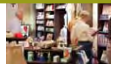
Our Museum Shop just had a makeover. To plan your shopping list, see page 9.