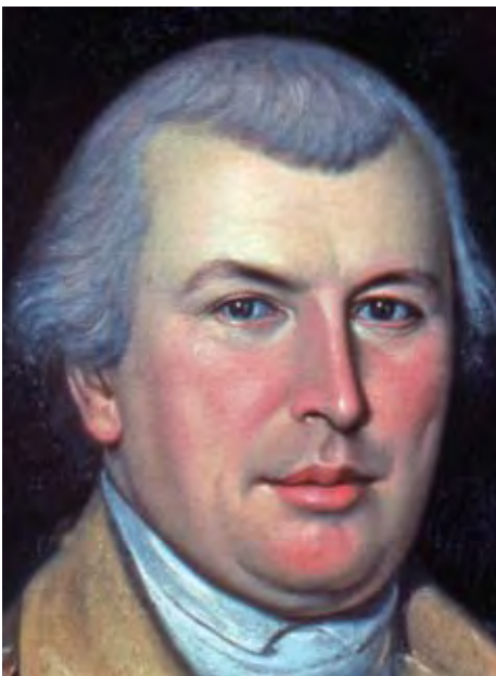
FAMILIAR PORTRAITS: LOCAL LEADERS AND NATIONAL HEROES ADORN THE WALLS OF THE DEBATING LIBERTY AND BEWITCHING COUNTRY GALLERIES.

Our hope is that by adding all of these real “live” voices, our Voices of a City: Greensboro, North Carolina exhibit will be an inspiring, enriching and memorable experience for children, for families, for everyone.