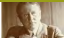
5 by O. Henry returns this fall. For schedule, see back cover.