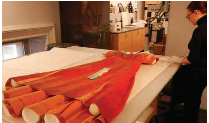
Experts studied Dolley's dress after its arrival in Washington

National DAR Museum, also said to be from White House drapes. The fabrics didn't match, as the DAR sample wasn't velvet, encouraging further research. The empire-style dress construction has some alterations, suggesting work by a novice seamstress. No documents have been discovered that connect the red dress to the White House drapes saved from the torch of British troops. Yet, there is the captivating question of why Dolley saved this dress to the end of her life. Was it a memento, gorgeous fabric she could not part with or a treasured piece symbolizing an historic event? We may never know, but the legend does its job, for it keeps us intrigued, wanting to learn more.