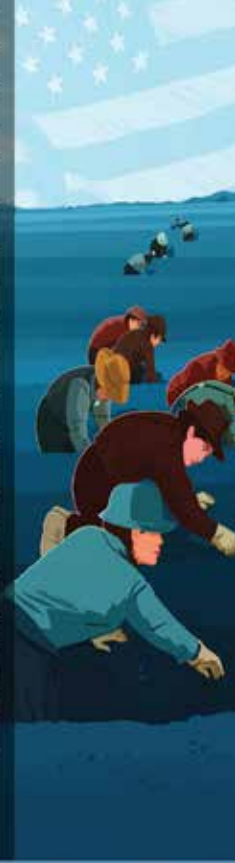
Illustration by Chris Danger

For a free mobile tour app, which also includes fascinating interviews, visit the App Store under Wide Earth . A 14-page illustrated graphic narrative e-book, featuring work by seven Asian Pacific American artists, is free to download by googling I Want the Wide American Earth e-book.