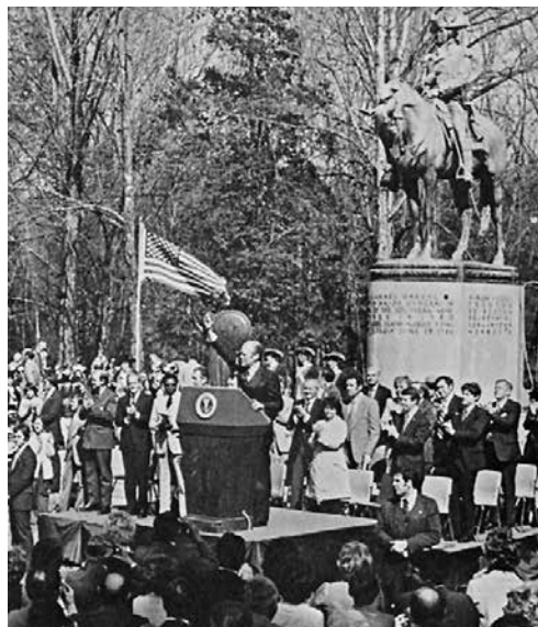
Learn about Presidential visits on October 17