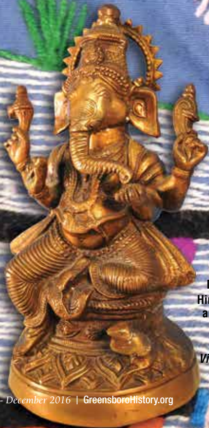
Ganesh Decorative Statue Hindu God of Wisdom and the Remover of Obstacles