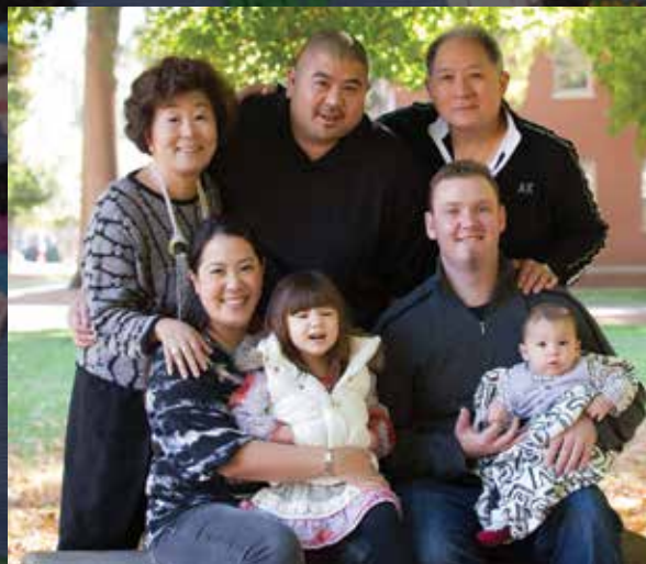
The Lam and Balfour Families, 2013 Front (l-r) Tiffany Lam-Balfour, Genevieve Balfour, David Balfour, Xavier Balfour Back (l-r) Belinda Lam, Wally Lam, Che Lam