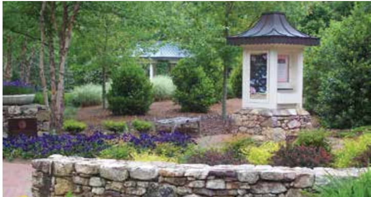
Greensboro Beautiful Inc.

The museum is working with students to develop temporary exhibits and programs in the coming months, so stay tuned to learn more about this understudied part of Greensboro history.